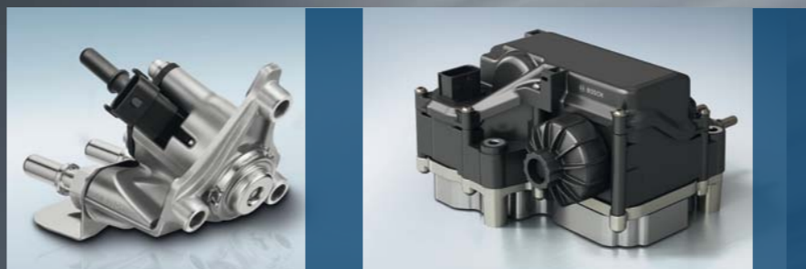
Denoxtronic 2.2 for commercial vehicles. Dosing Module (left) and Supply Module

Staying below the world's strictest limits for nitrous-oxide emissions will, in future, only be possible by the use of efficient exhaust-gas treatment systems. With our Denoxtronic for commercial vehicles we have already been offering such a system on the market with great success since 2004. In the meantime, this system is also being successfully used in off-highway applications.