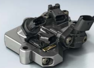
Departronic Injection Unit (left) and Metering Unit

An interesting experiment carried out in 2004 by the Cancer Institute in Milan came to the following conclusion: a modern 2-liter diesel engine running idle for 100 minutes generates approximately the same amount of particulate as a burning cigarette. This example is not intended to suggest harmlessness but, rather, to demonstrate the high technical level which vehicle manufacturers and component suppliers have already reached today.